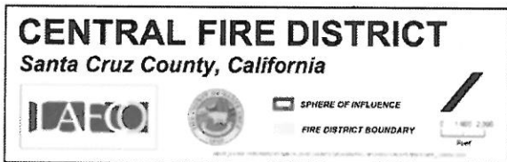
Exhibit A, Map of Upper Porter Gulch Area Annex to the Central Fire Protection District Detach from County Service Area 48, County Fire