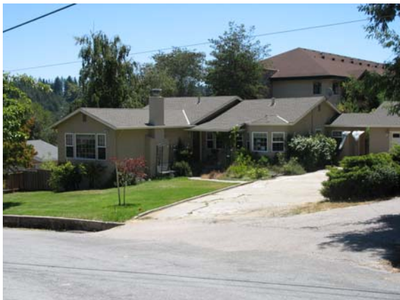
151 Miraflores Road

The property is designated in the County General Plan for very low density urban uses (1.0 - 4.3 units per acre). The property is within the County's Urban Services Line, and is zoned R-1-15 for single-family residential uses.