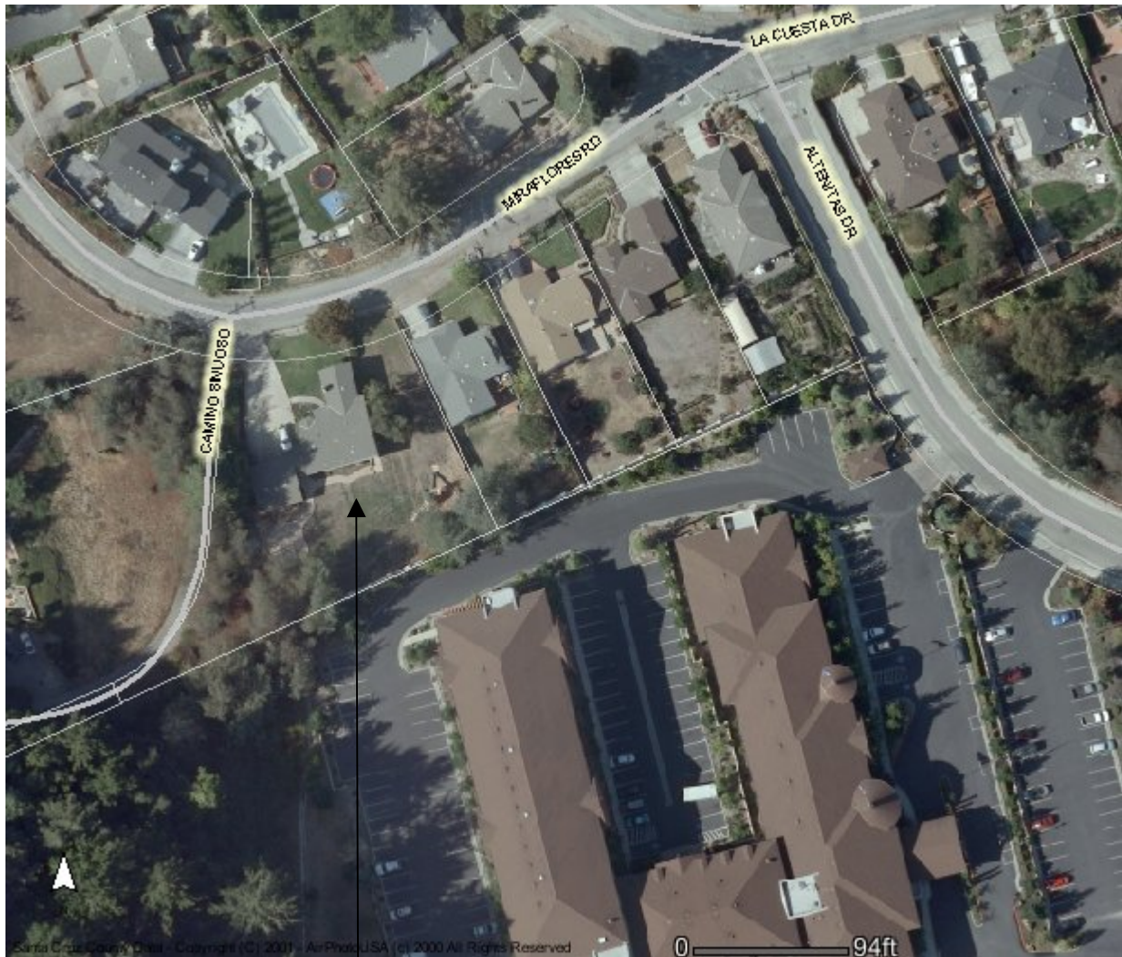
151 Miraflores Road

The surrounding land uses are the Scotts Valley Hilton Hotel immediately to the south of the site, and the single-family residential area of Mañana Woods on the other three sides.